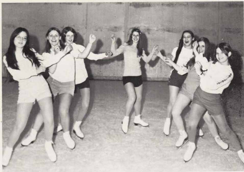
"HOT STUFF" — SENIORS