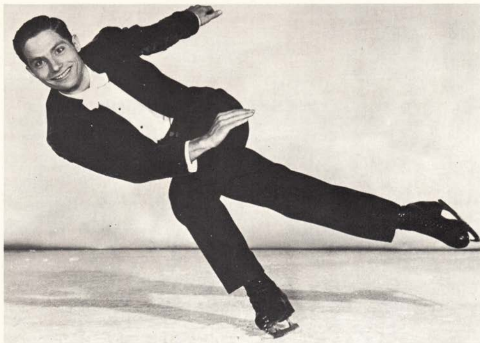
DONALD JACKSON — GUEST ARTIST